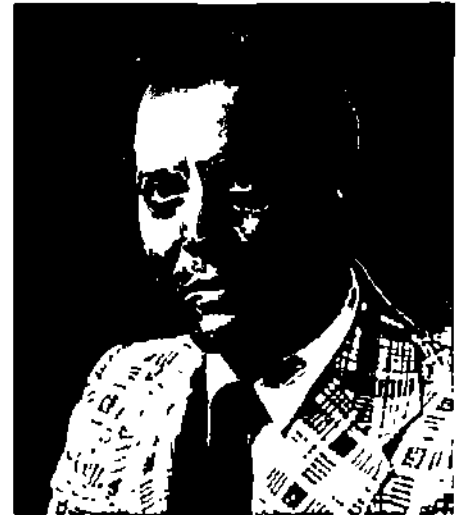
Raymond E. Fowler

Here is a provocative work that dares to respond to the ultimate question for any follower of UFO and extraterrestrial phenomena: Why are they here? Based on amazing new discoveries, The Watchers presents an answer that will shock and startle you.